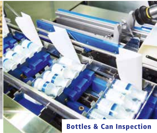
Bottles & Can Inspection